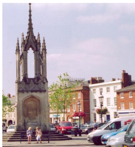
Historic and wall mounted lighting, combined