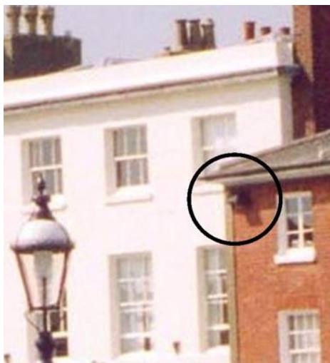
Lighting in an area enhancement scheme