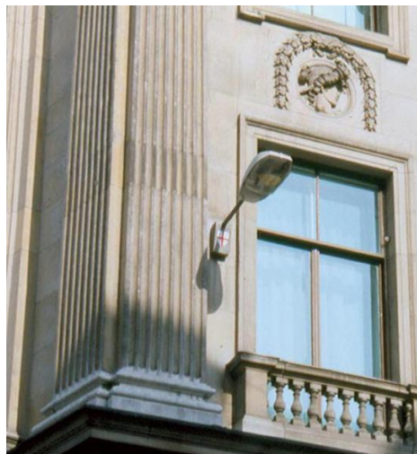
Wall mounted lighting on a historic building