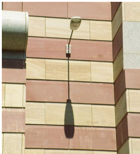
Wall mounted lighting on a new building

Reducing the clutter of unsightly and obstructive street lighting columns